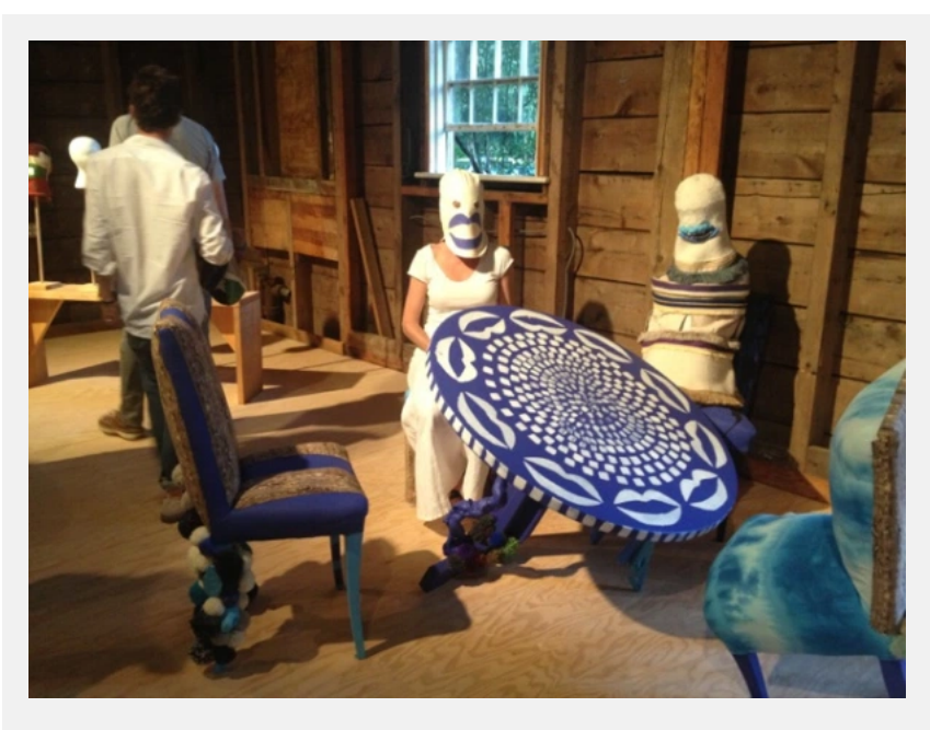
The Dining Room