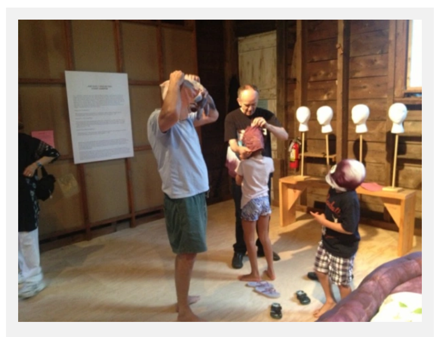
Viewers donning the masks